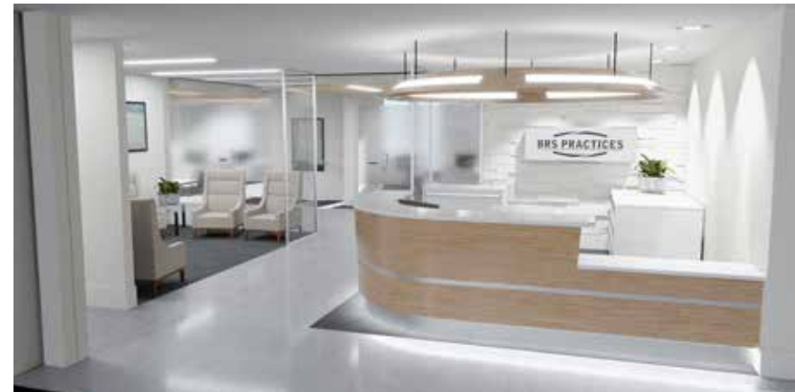
Images are artist conceptual renderings. Features, dimension, & specs are subject to change without notice.

FOR SALE: STRATA OFFICE UNITS LOCATED IN LANGLEY'S 200TH STREET CORRIDOR | MARKETED BY FRONTLINE REAL ESTATE SERVICES LTD. | CALL 604-583-2500 FOR MORE INFORMATION